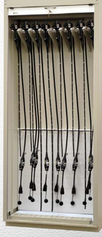
Scope Storage with Tambour Door with Drying Package #SC16DP

Tall Scope Storage with Glass Doors with Drying Package #SC16DRDP