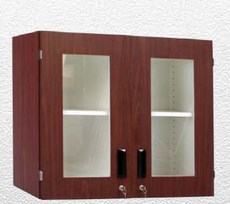
Wall Cabinet #MSWCS3035-GD