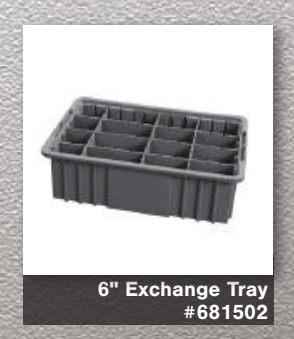
*Multiple Tray Sizes Available. Contact Harloff for More Information