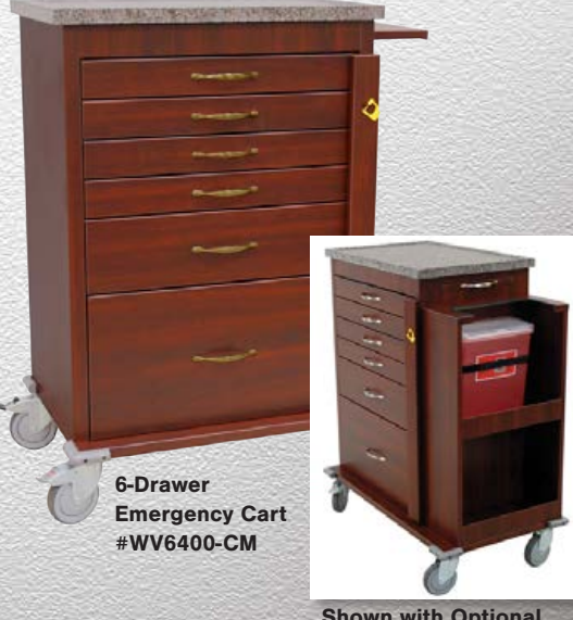
Shown with Optional Side Cabinet