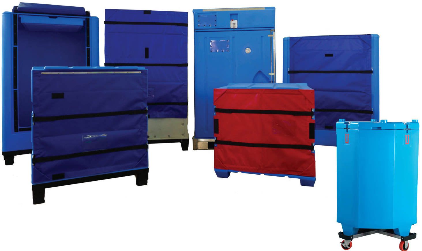
FRONT LOAD MODELS

ThermoSafe insulated containers are strong, durable, and specifically manufactured to be used and reused. Replacement latches, hinges, handles, and other handling and replacement accessories are available at a low cost.