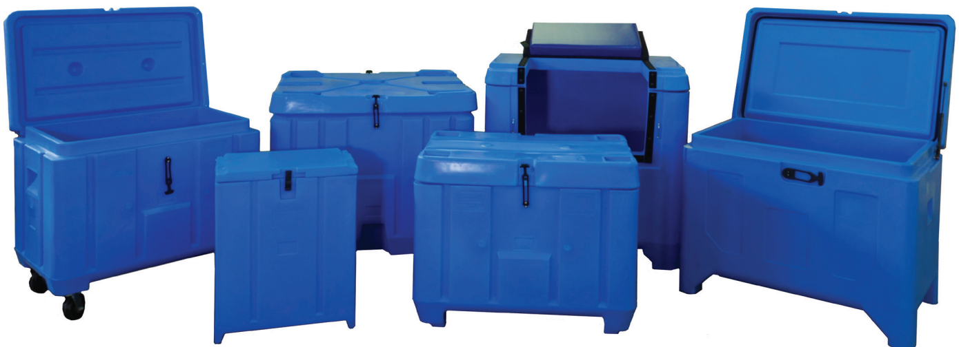
TOP LOAD MODELS

Ranging in various sizes and styles, these durable insulated containers make storing, transporting, and unloading efficient and worry-free. High impact polyethylene can handle the rigors of transport: the tight fitting lid and container construction, maintains temperatures, and maximizes shipping and transporting efficiency. Pre-qualified solutions available.