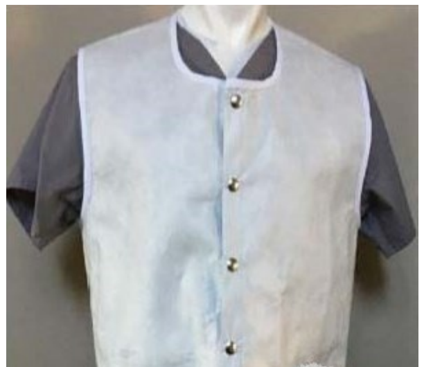
Insulating Vest worn over inner scrub