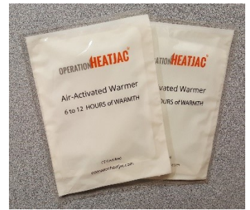
Air activated heat packs placed inside pockets