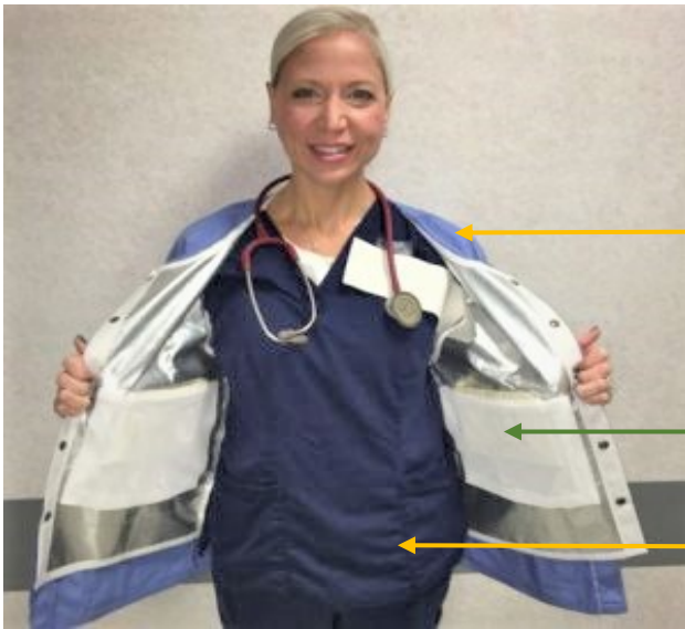
Outer scrub jacket

Note: One can place 2 or 4 air activated heat packs in the inside pockets of the insulating vest depending on how warm you want to be. One can also place an IV bag on each side in the 2 larger interior pockets.