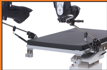
Metal-free perineal end of table: unobstructed imaging access to edge of tabletop.