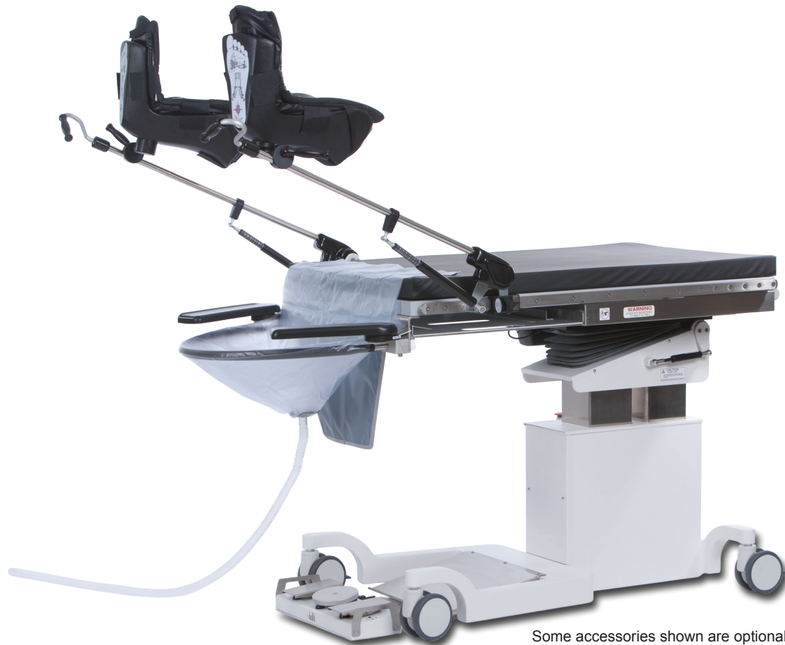
Some accessories shown are optional

Imaging table for urology and multi-purpose use