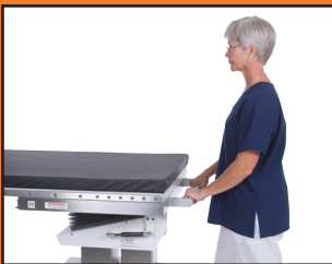
Built-in transport handle