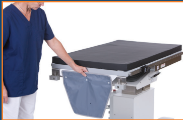
Removable lead-vinyl x-ray shield