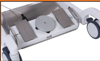
Built-in footswitch storage tray