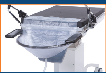
Removable, collapsible drain bag support (elbow rests are optional)