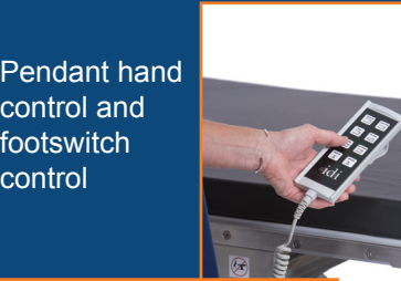
Pendant hand control and footswitch control