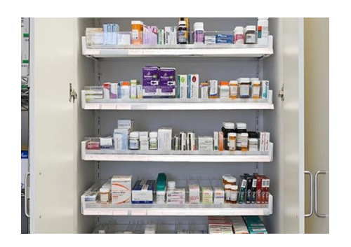
Shelf size options and SKU (stock keeping unit) capacity per shelf