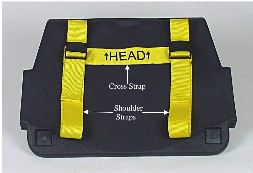
Figure 6 – The BackBoard

Note: Optimal Thumper ® CPR performance requires using the BackBoard.