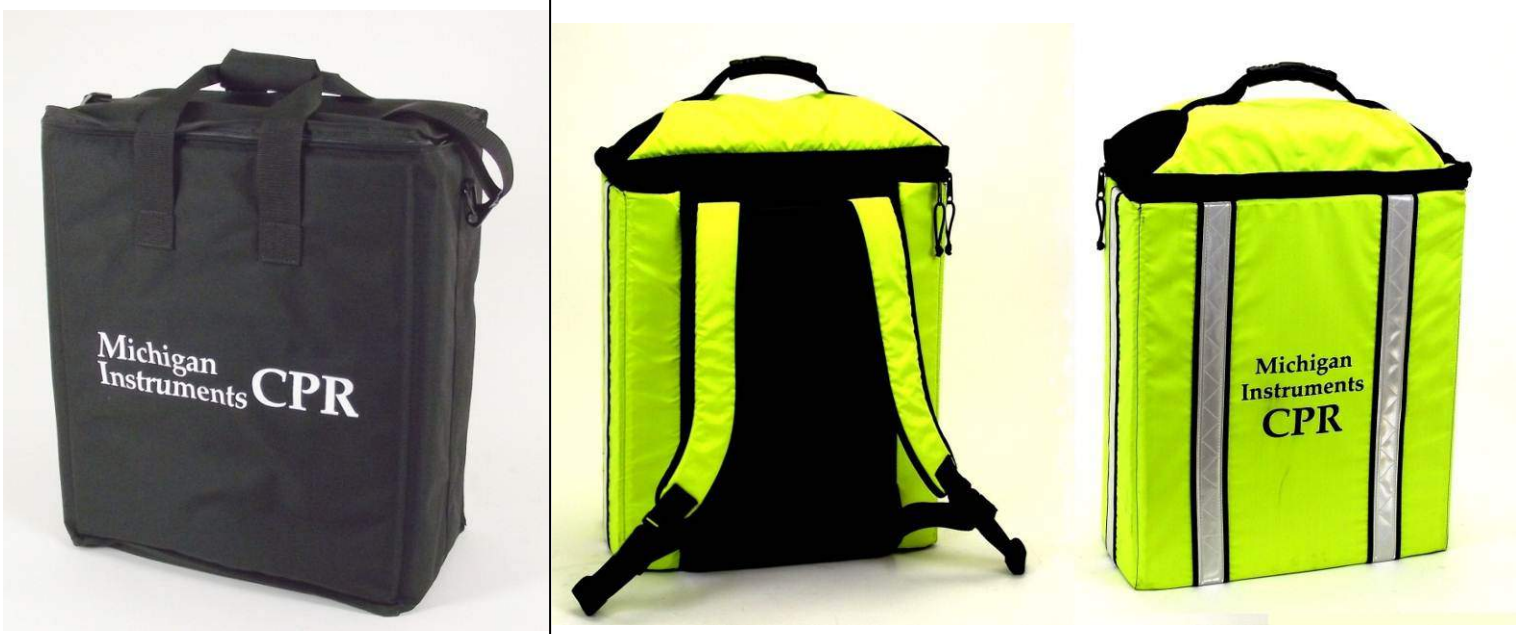
Figure 8 – Carrying/Storage Case – shoulder strap (left) backpack straps (right)

The carrying/storage case is constructed of a durable nylon. The Thumper ® , O 2 Supply Hose and code related supplies are stored in the case in a manner which permits immediate access to the device and facilitates easy setup at an emergency site.