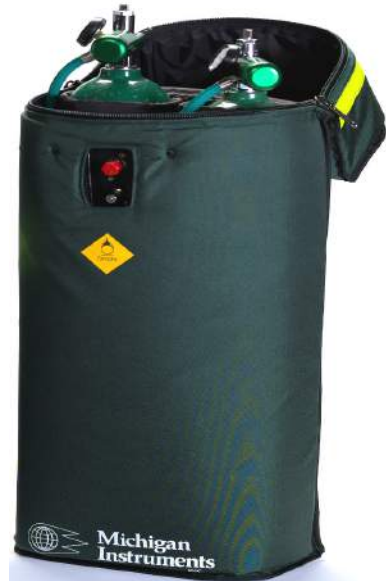
Dual tank carrier for “D” or “E” aluminum cylinders (Cylinders not included)