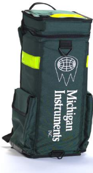
Single tank carrier for “DD” carbon fiber cylinder (Cylinder and Regulator available separately)