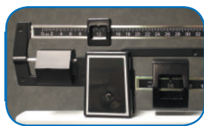
POUNDS (Black Bar)

Simply twist the rotating weighbeams to change between lbs and kg