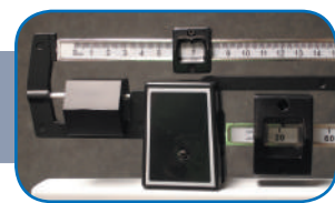
KILOGRAMS (White Bar)