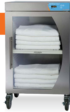
Shown with optional casters