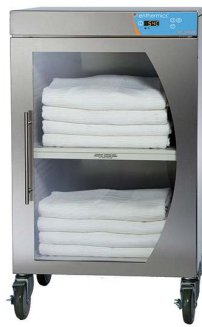
EC750 with optional casters