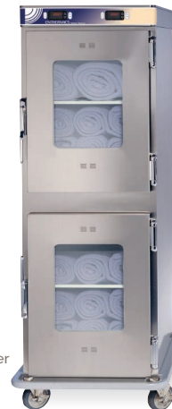
Shown with optional bumper