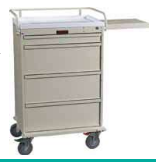
VLT360PC (not shown) Value Line Medication Cart with key lock, adjustable dividers. Capacity of 150 MOT cards and internal narcotics box designed to hold punch cards