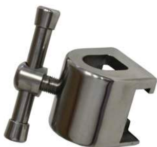
Model #6109 Universal Clamp