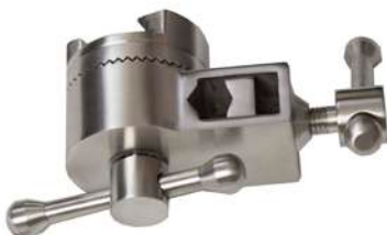
Model #6110 Tri-Clamp