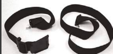
Model #6126 Restraint Straps