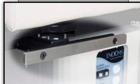
Model #6112 Base Rails (pair)