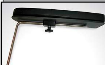
Model #6124 Padded Armboard