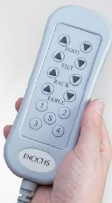
Model #6145 Programmable Hand Control