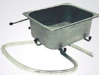
Model #6137 Urology with Screen, Drain & Hose