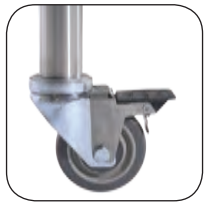
Casters are 4" in diameter with the front two locking.