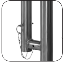
Safety locking pin for securing upper tier shelf