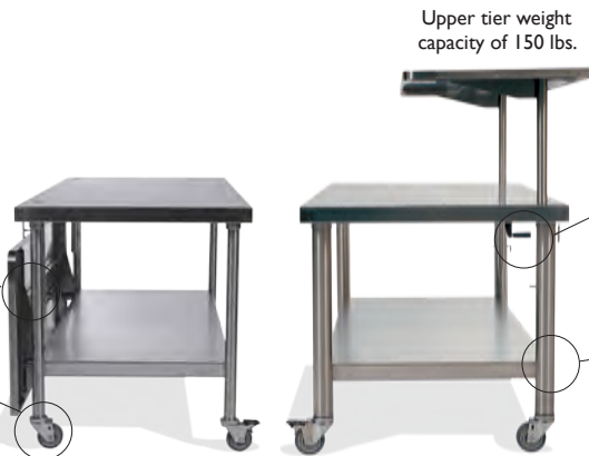
Upper tier weight capacity of 150 lbs.