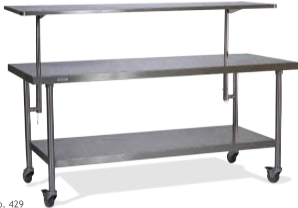
Part No. 429 Big Case Back Table