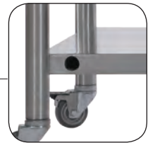
Post hole for use in storing the upper tier shelf