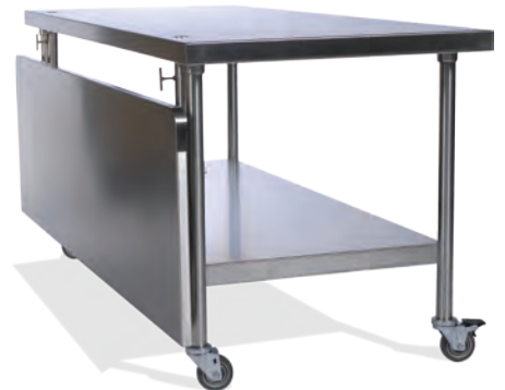
Store the shelf and use as a standard back table