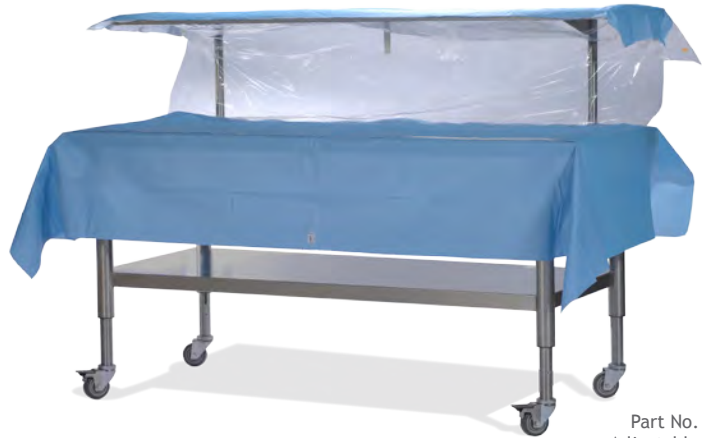
Part No. 429-ADJ Adjustable Back Table

OR Specific is a leading provider of stainless steel operating room back tables and surgical instrument tables. The Big Case Back tables are specifically designed to accommodate large cases such as orthopedics, spinal fusions, neuro, endoscopy, open heart and craniotomies. The additional space created by the upper tier shelf promotes improved visibility, organization and arrangement of instrument trays without the need for stacking.