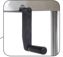
Quickly raise or lower table using the table crank.