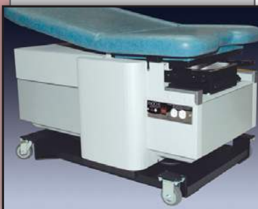
Model #4150 Caster Base