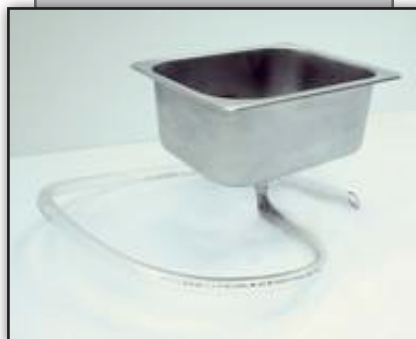
Model #4137 Urology Pan