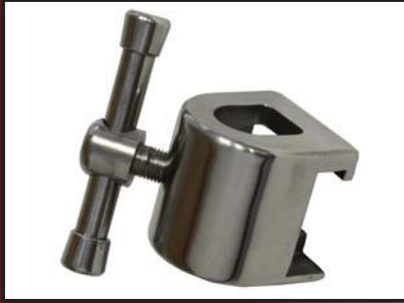
Model #6109 Universal Clamp