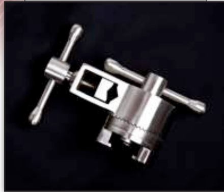
Model #6110 Tri-Clamp