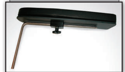
Model #4124 Arm Board

Requires #4111 Headend Rails and #6109 or #6110 clamp